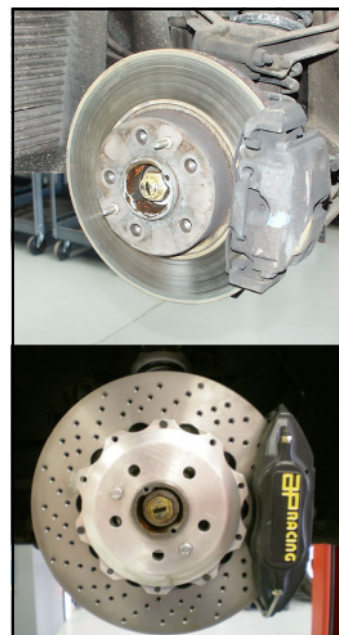
Mondial RR GT brake vs stock